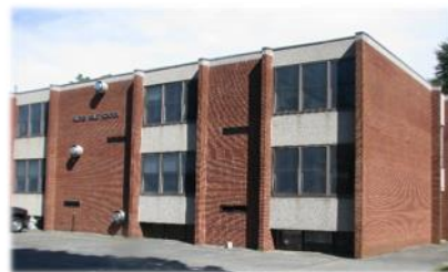
St. Mary's and Sacred Heart Parishes and Sacred Heart School