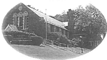
Sacred Heart Church