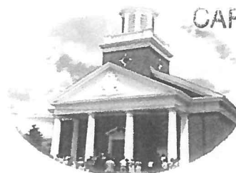
St. Brigid Church